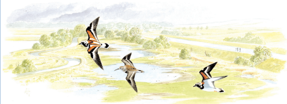
Migrating Turnstones Arenaria interpres and a Dunlin Calidris alpina crossing an inland county boundary