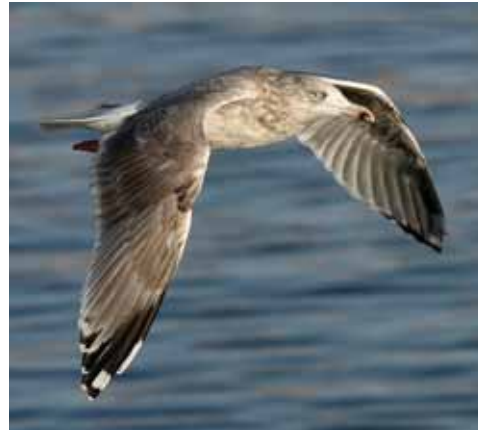
83. 3CY (3W) Herring Gull, North-east Scotland, 2 Nov 2008. This bird shows an extensive brown wash to its wings, a well-streaked head, has only limited black on P5 and (already) a very pale eye. Individually and collectively, these features make confusion with cachinnans unlikely. 3W argenteus Herring Gulls regularly show a complete, deep black band across P5, unlike this argentatus , which has isolated dark smudges. So, the presence of a black band on P5 is not a key feature at this age. Note that P10 is not yet fully grown.