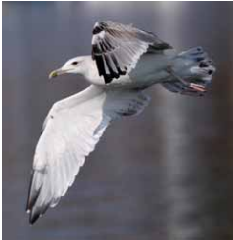
82. 3CY (3W) Caspian Gull, Lithuania, 10 Sep 2009. The primary pattern of this bird is beginning to take on some of the features of adults – note the grey tongues eating into the black wing-tip. The outer primary coverts and the alula retain extensive, blackish-brown marks.