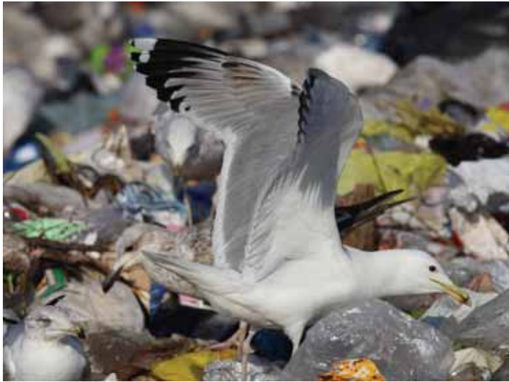
85. 5CY (4W) Caspian Gull, Latvia, 13 Apr 2009. The extensive dark areas on the primary coverts, dark grey wash on the outer webs of P5–P7 and the black band across the tip of P10 suggest that this is not a fully adult bird.