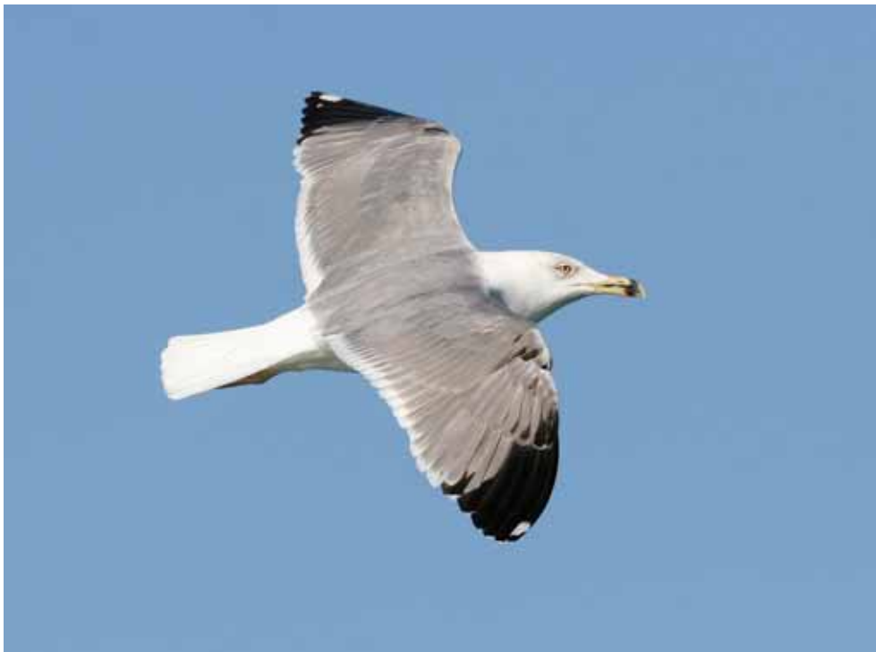
84. 3CY (3W) Yellow-legged Gull, Spain, December 2006. Birds of this age are variable. This one has a rather large mirror in P10 but on others it is much smaller or even lacking. It has a clean white tail but many retain vestigial dark marks. The extensive blackish-brown primary coverts contrast with the otherwise grey upperwing. The black of the primaries forms a solid wedge on the outer wing. Note the asymmetrical wing-tip pattern – there is a mirror on P9 on the left wing but not the right wing. Such asymmetry is not unusual in gulls; consequently, where a particular feature is critical for identification, it is always worth making sure that both wings have the correct pattern.