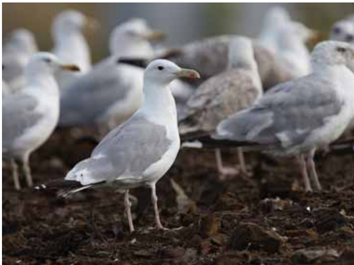
86. Adult Caspian Gull (centre left) with Herring Gulls, Latvia, 14 Aug 2008. This photograph allows direct comparison of jizz, bare-part colours and grey tones of the two species.