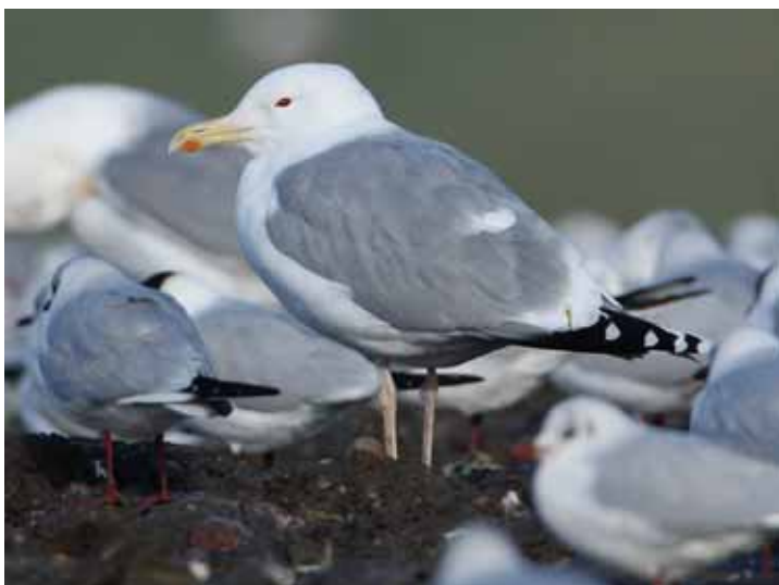
87. Adult Caspian Gull, Essex, 7 Feb 2009. This bird's eye is at the dark end of the range.